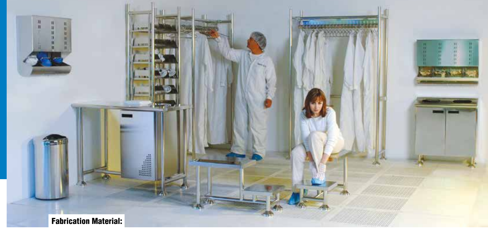
Stainless Steel 304 With Electro-Polished Finish